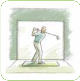
Indoor Simulators €30 - €45 per hour