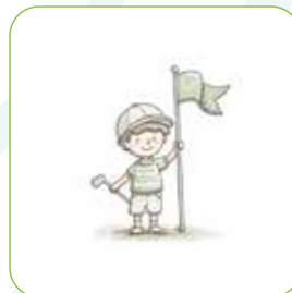
Junior Golf Camps and Events