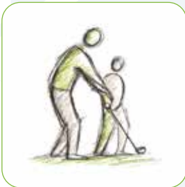
Golf Lessons for all age groups