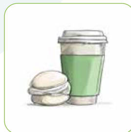
Café Sales Drinks/Snacks