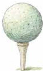
Outdoor Range €8 - €12 per bucket