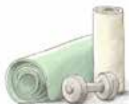
2 Studios for hire Dance/Fitness/Yoga