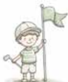
Junior Golf Camps and Events