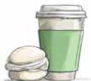
Café Sales Drinks/Snacks