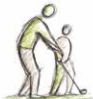
Golf Lessons for all age groups