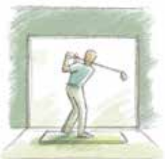
Indoor Simulators €35 per hour (4 people)